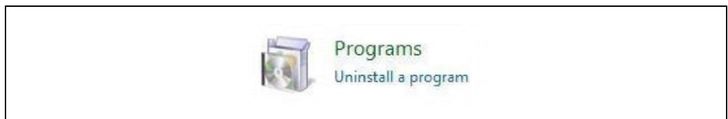
Figure 2. Uninstall a program